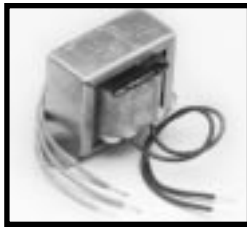
Style A with leads