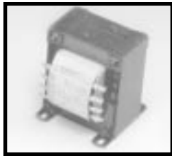
Style NV with lugs