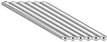
Series image - Reference only

1.27mm Pitch Round Conductor Flat Cable - 28 AWG (7 x 36) Stranded Tinned, 6 Circuits, Reel 30.48m Length