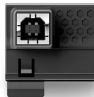
USB interface - Black